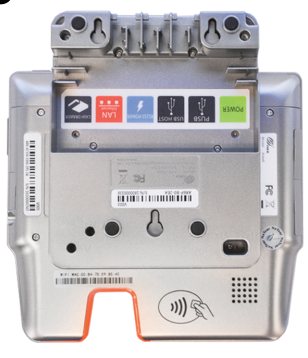
Aries6 with Integrated Plate