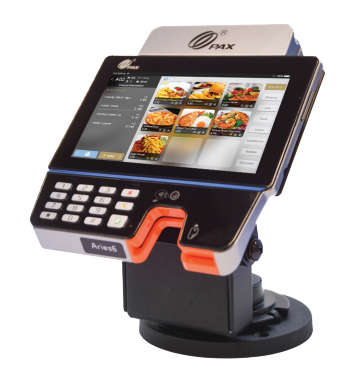
Aries6 Tablet installed on POS stand, Right Side